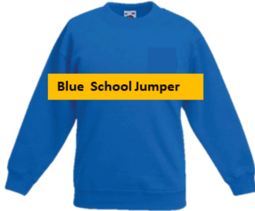
Blue School Jumper