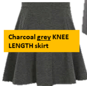
Charcoal grey KNEE LENGTH skirt