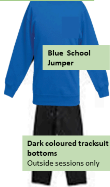
Dark coloured tracksuit bottoms Outside sessions only