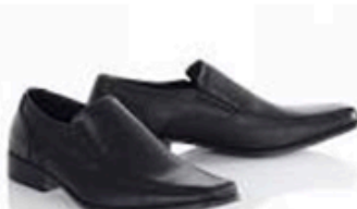
Black shoes or black trainers with no other colour