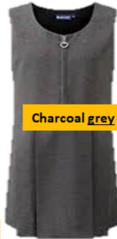
Charcoal grey DRESS