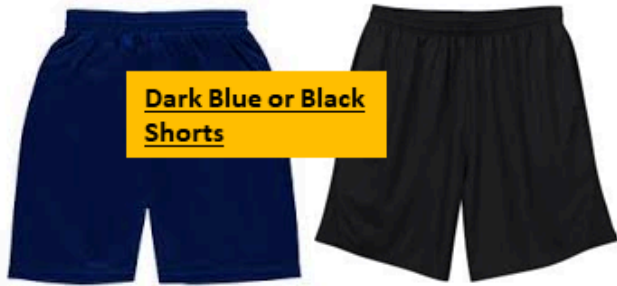
Dark Blue or Black Shorts