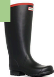
Seasonal Option Wellington Boots