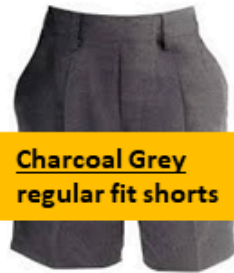
Charcoal Grey regular fit shorts