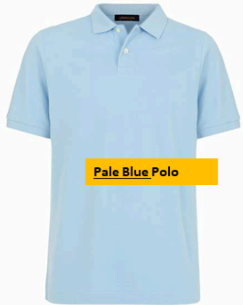
Pale Blue Polo